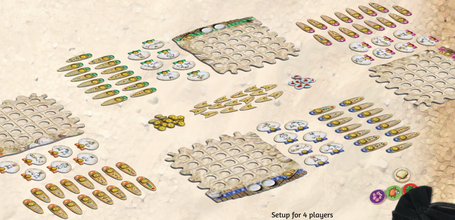
Setup for 4 players